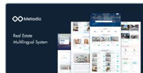
Metadia - Real estate management