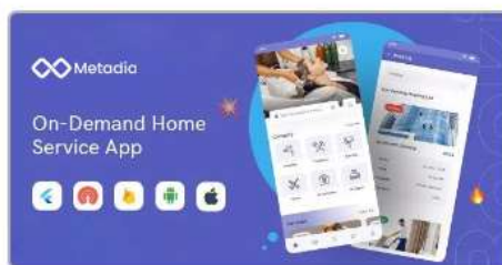
Metadia - On-Demand Home Service