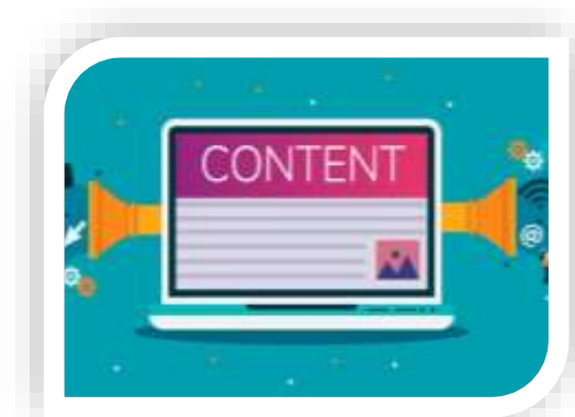
Digital Content Creation