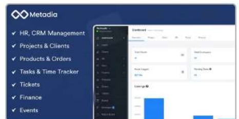
Metadia -HR, CRM and Project Management