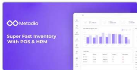
Metadia -Inventory Management System with Pos & HRM