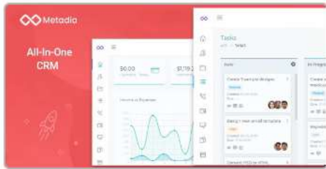
Metadia - Project Management