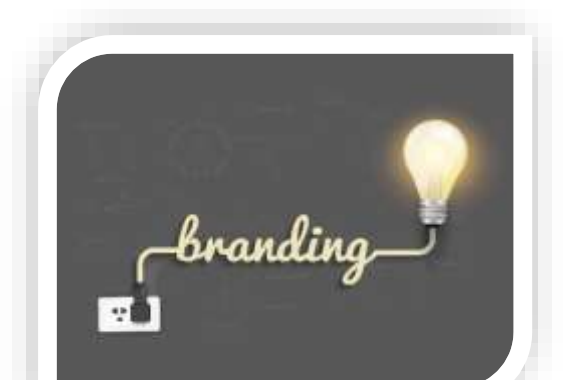
Branding & Promotion