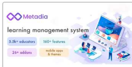
Metadia -Learning Management System