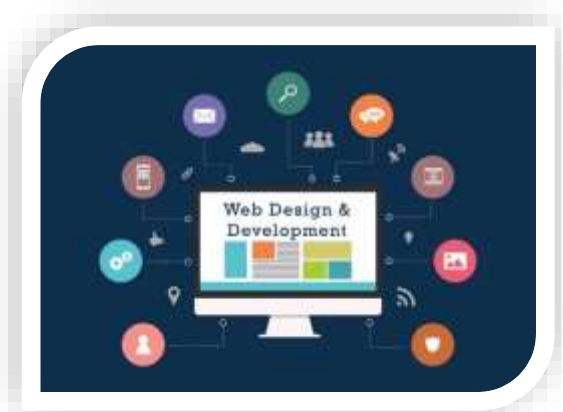
Web Designing & Development