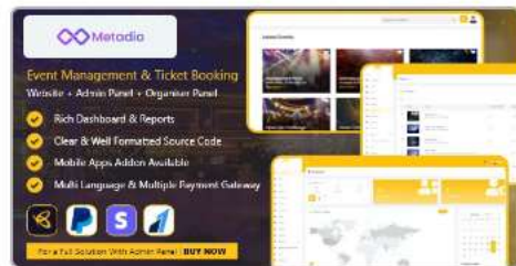
Metadia -Ticket Sales and Event Booking & Management System