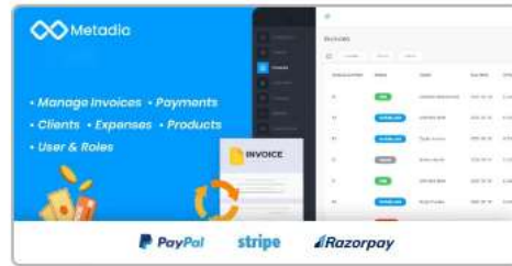
Metadia - invoice management system